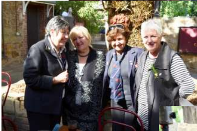
The Girls L to R: