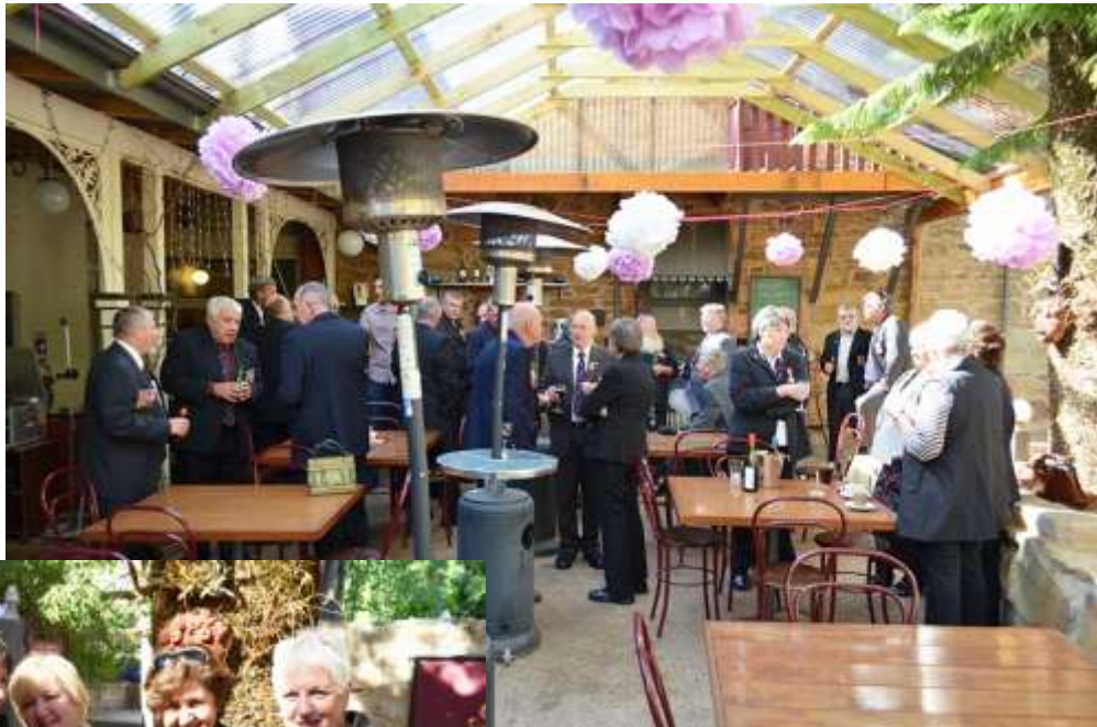
At the Goldmines after the March