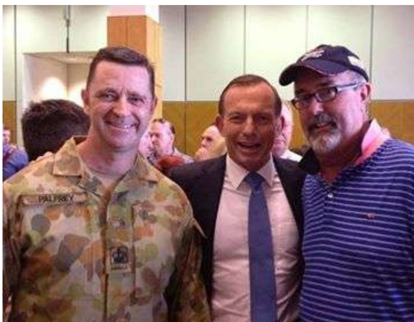
Another Classic Photo for the Photo Album.

Hopefully, the Senate with ALP support will pass the Bill.