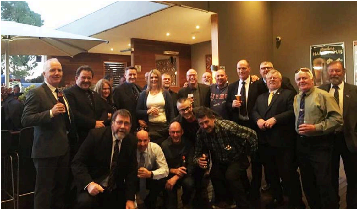
It was very much a Litho Sqn Reunion